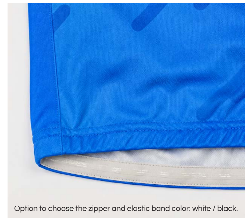
Option to choose the zipper and elastic band color: white / black.