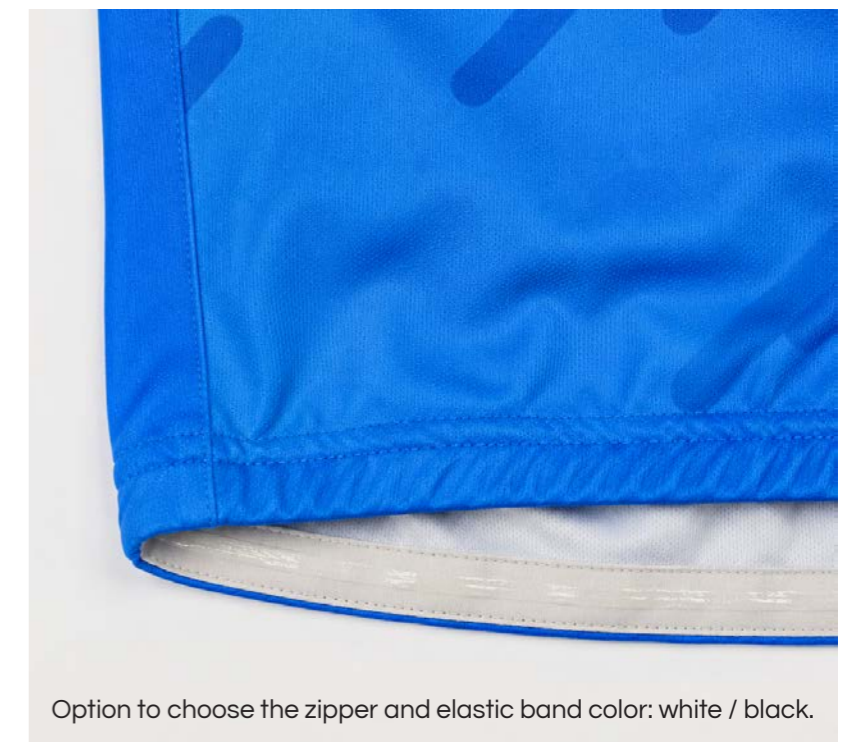
Option to choose the zipper and elastic band color: white / black.